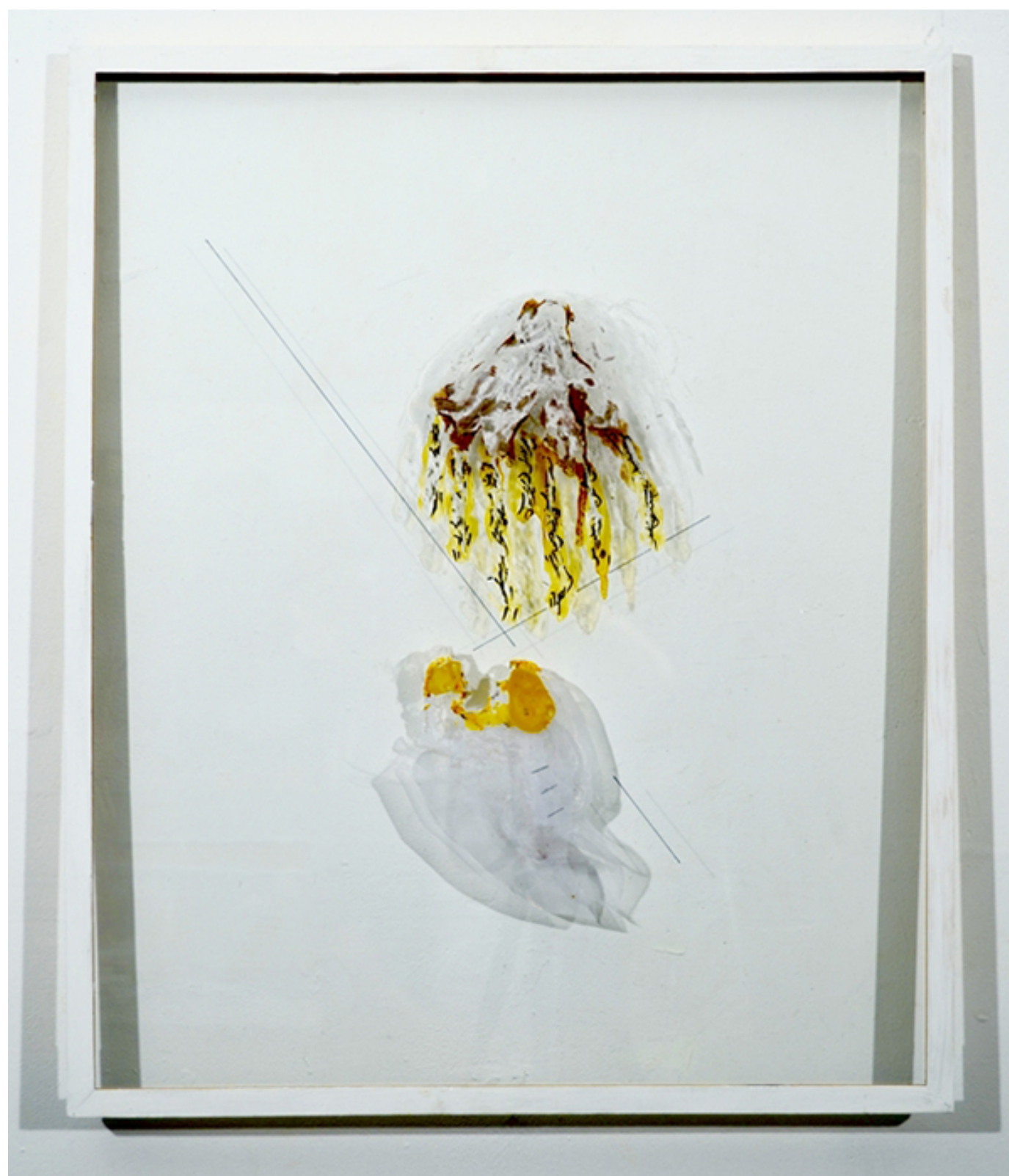
Chris de Boschnek, Untitled No. 12 (2015).