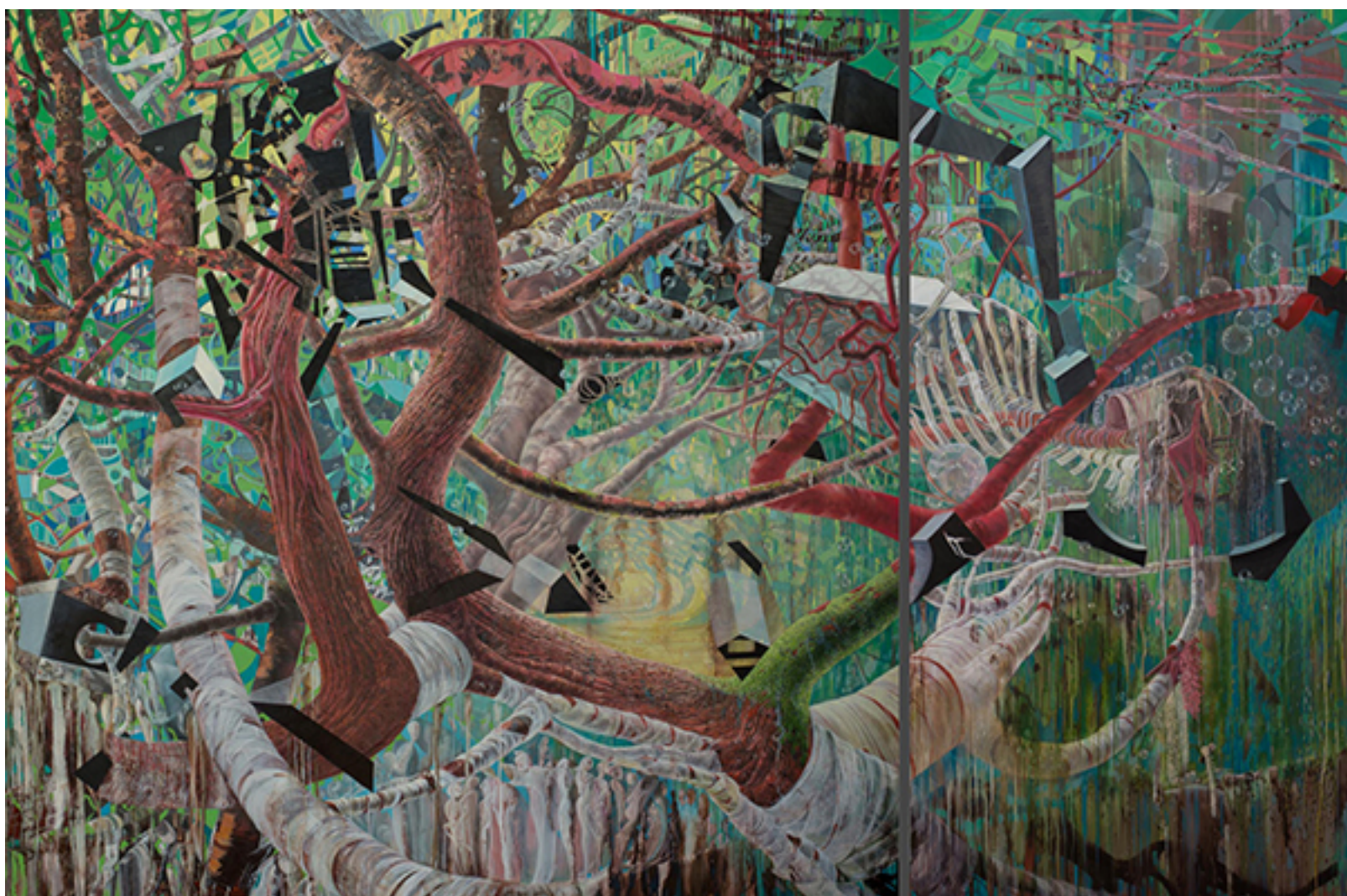
Fatemeh Burnes, Wonderland (2014–15). Photo: courtesy C24 Gallery.

Jedd Garet, Architecture (2013). Photo: courtesy C24 Gallery.