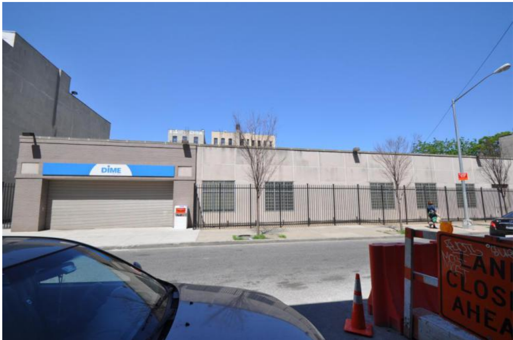
263-277 SOUTH 5TH STREET.